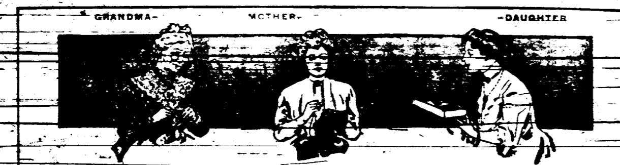
These Pictures Tell the Story

Grandmother - Mother - Daughter Hibleproof Hosiery You no longer think of knitting your own stockings because it takes so much time. Then be equally up-to-date and let us relieve you of the drudgery.